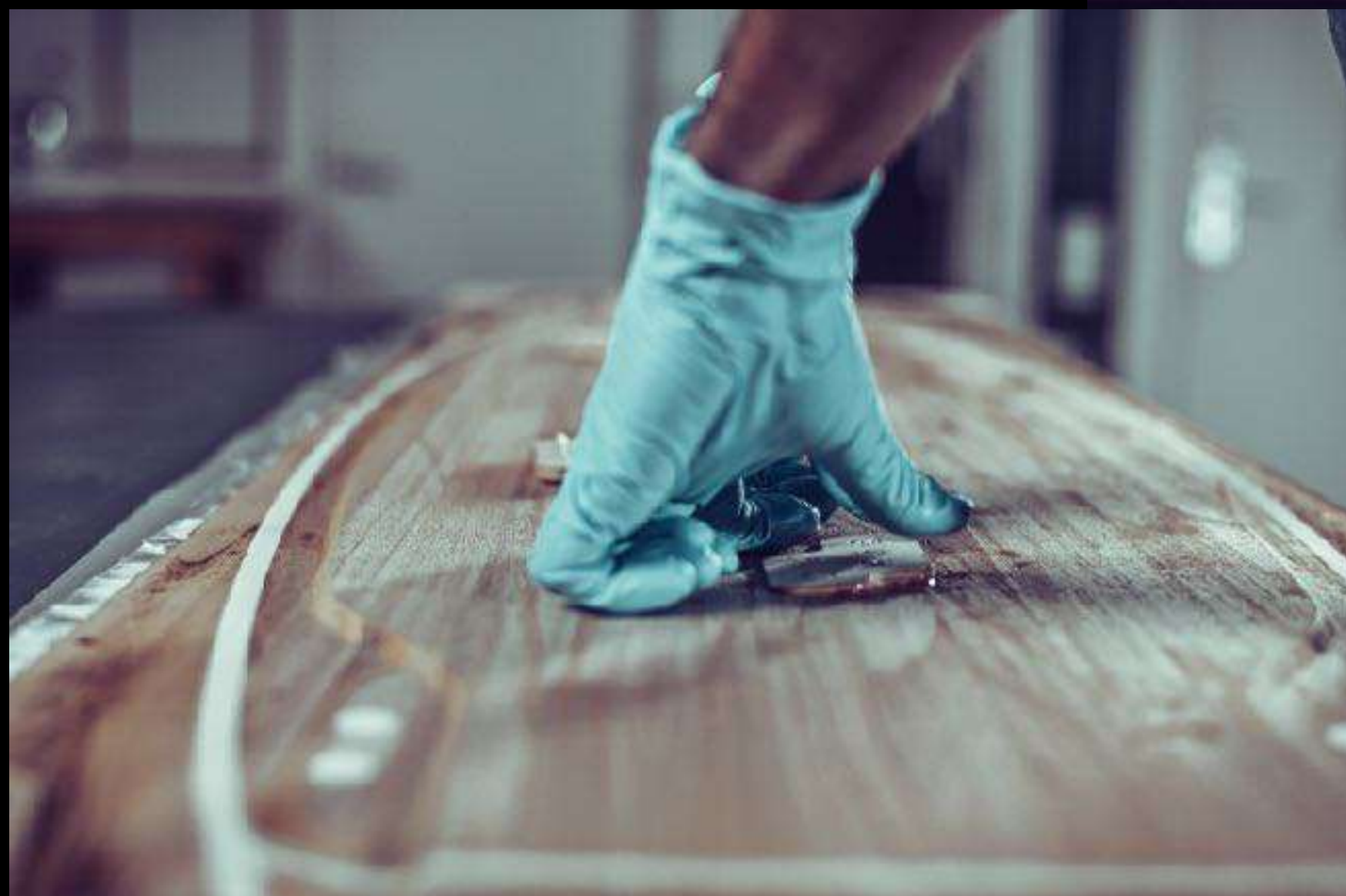
Yeah tighten those inserts!