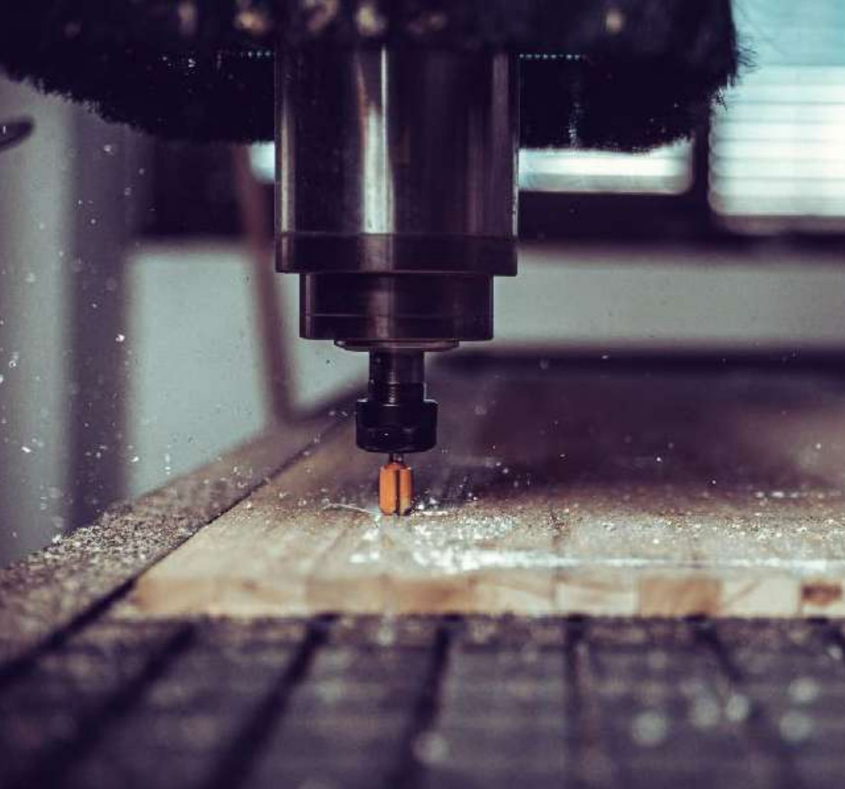
Okay let me tell you how I'm made...