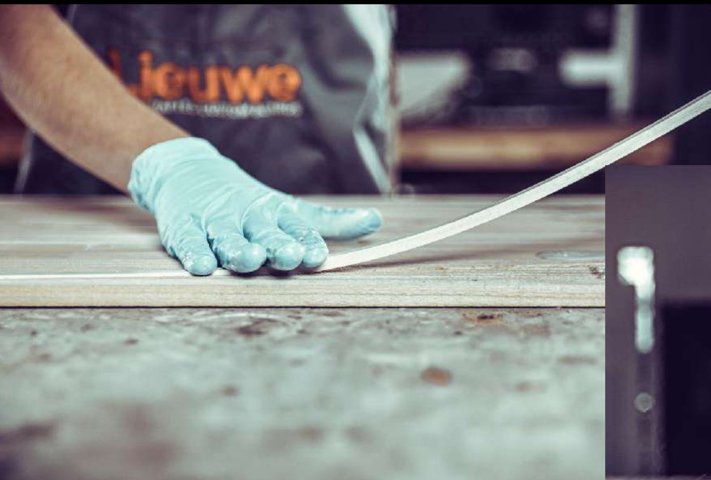
Indestructible with my new break proof bumper.