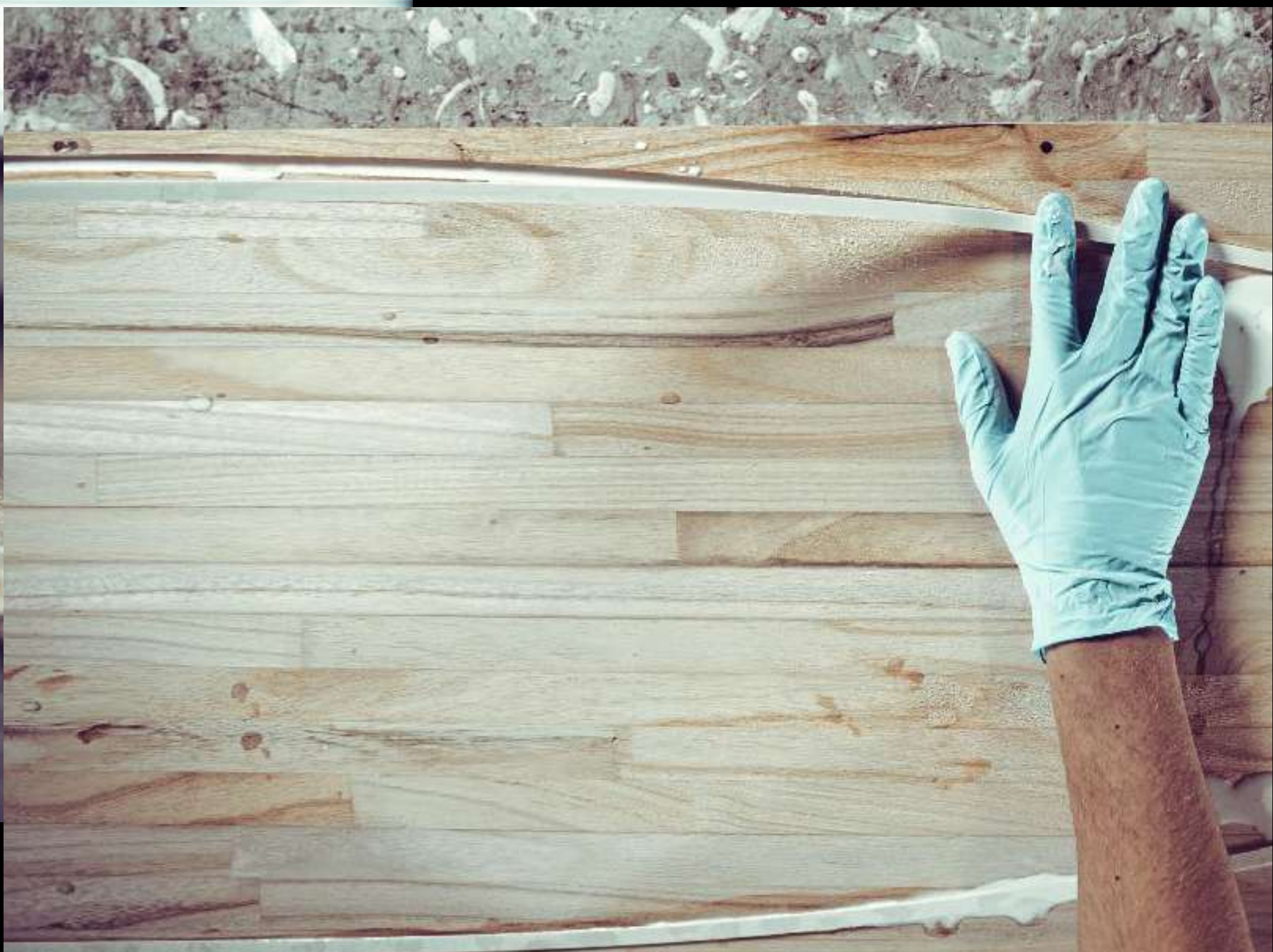
Originating from the best Paulownia wood type, I'm precisely milled in perfect shape by Lieuwe's hand built machines.