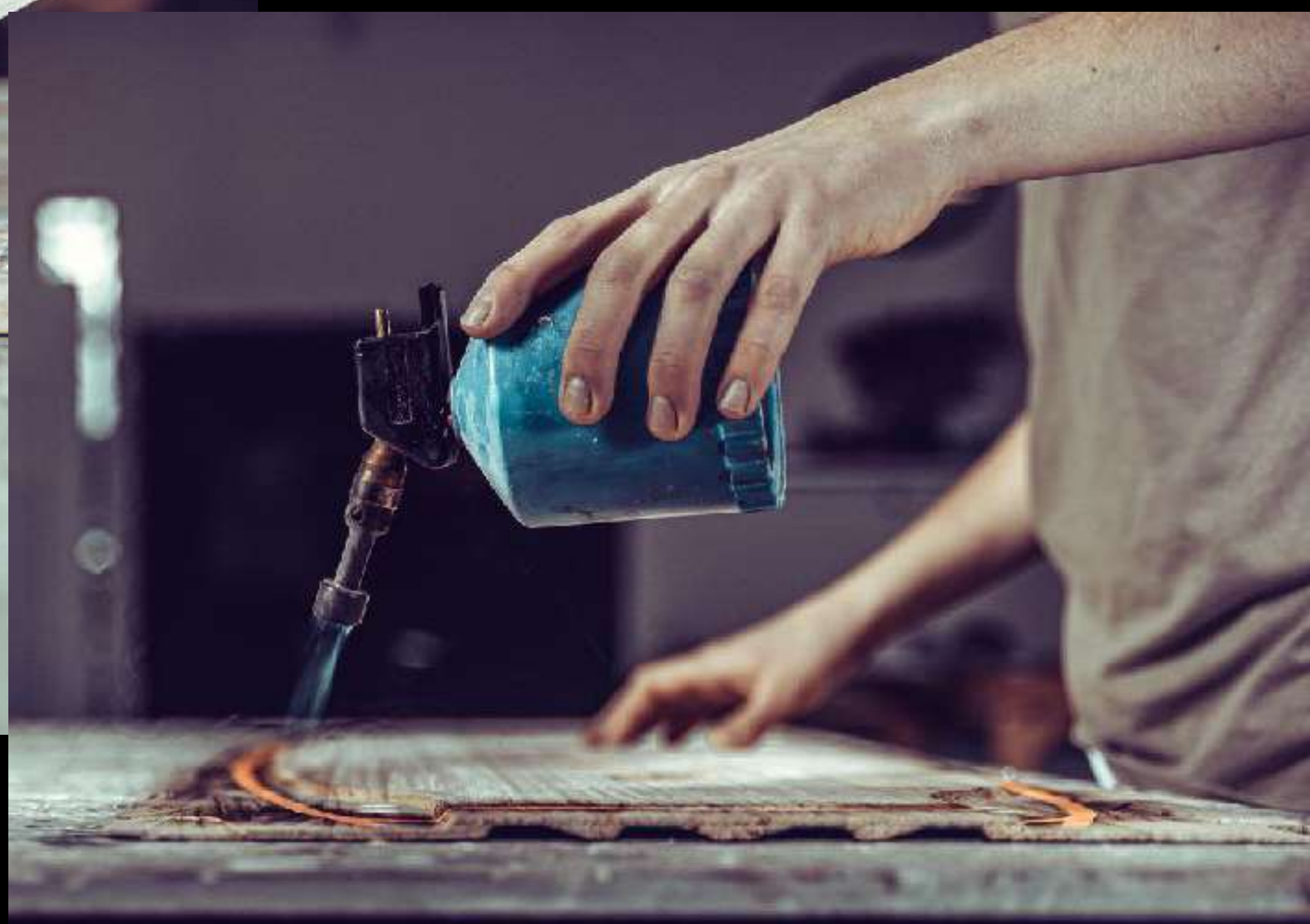
Do we really have to do this?....